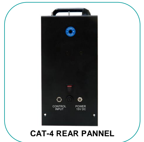
CAT-4 REAR PANEL